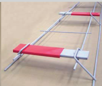
SPEED BASKET ®