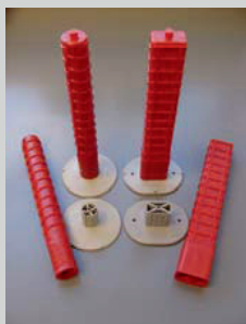
SPEED DOWEL ®

Greenstreak has other doweling systems available for construction, saw cut contraction and expansion joints. Please consult a Greenstreak engineer for additional information.