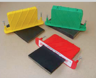
SPEED PLATE ®